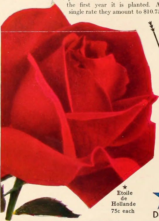
★ Etoile de Hollande 75c each